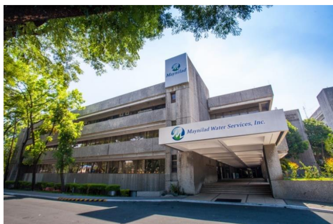
Maynilad Head Office in Metro Manila, Philippines

Implementation of Energy Management System with expansion of scope from 7 to 10 facilities leading to energy conservation while still meeting demand of expanding customer base and service coverage area.